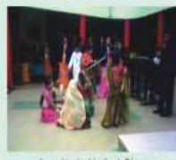
Janmashtami celebration in Primary