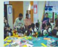
IK-II Family Day at School