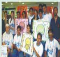
Let's fight Swine Flu together