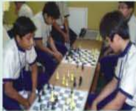
Inter House Chess Competition