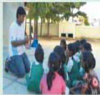
Spreading awareness among young minds