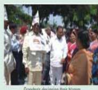
Grandpa's designing their blazers on grandparents day