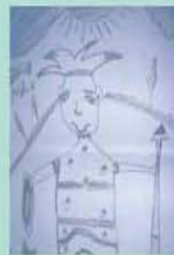
Suraj B, Grade: VI