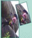
DRS Frolic Programme @ DRSIS