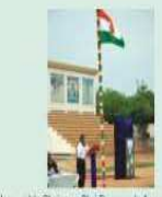
Honourable Chairman Shri. Dayananda Agarwalji addressing the gathering during independence day celebration