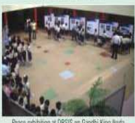
Peace exhibition at DRSIS on Gandhi King leads by Bharat Soka Gokul