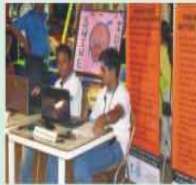
Know more about swine flu