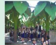
IK-II Field Trip to NTR Park