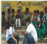
Speaking to the young ones