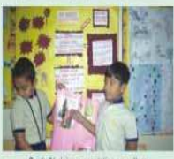
Grade IV giving presentation on culture and our expression through it