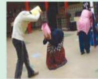
Parents participating in a game on IK-II Family Day