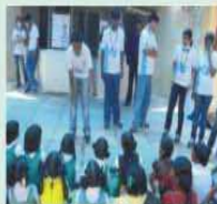
Let us understand swine flu through a skit