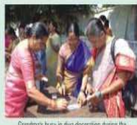
Grandma's busy in diyas decoration during the grand parents day celebration