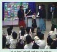
"let us draw" art and craft work in primary