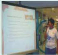
You just need to be careful....