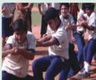
Inter- House Tug of War Competition