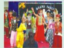
IK-II Dance on Grand Parents Day