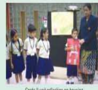
Grade II unit reflection on housing