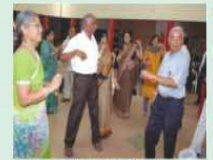
Takla dancing game by Grand Parents on Grand Parents Day