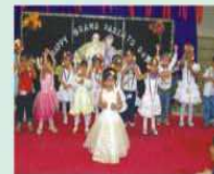
IK-I dance on Grand Parents Day