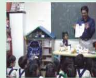
IK-III Unit of Inquiry on Personal Histories