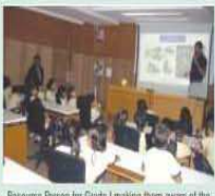
Resource Person for Grade I making them aware of the process of Field to table