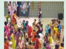
Janmastami celebrations by IK