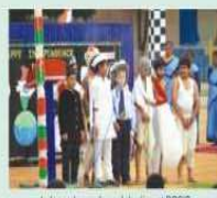
Independence day celebration at DRSIS