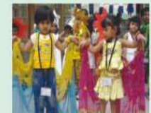
IK-I Assembly presentation