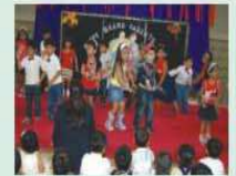
IK-II dance on Grand Parents Day