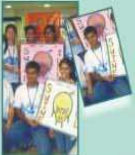
IBDP CAS Programme at Hyderabad Central Mall