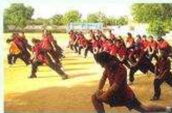
Evening Games Hour