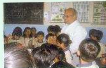
Grade I visit to institute of Aeronautical Engineering