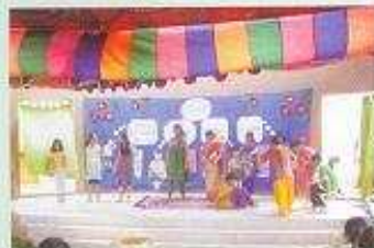
Students of grade V presenting the impact of right decision making on society through a cultural show during the exhibition.