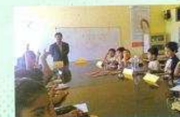
Grade II students visit the Physics Lab.