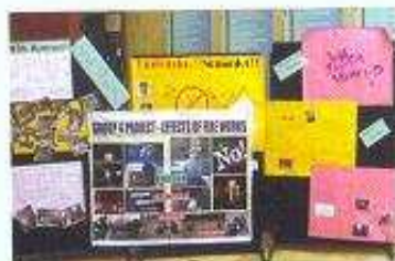
The Importance of Biology, Chemistry and Physics.