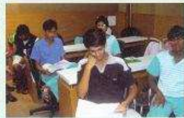
Study Hour for Grade X