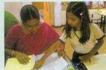
Student Led Conference in Primary.