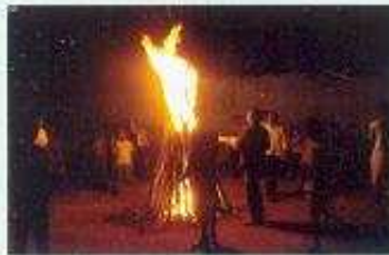
Grade III - Night Stay