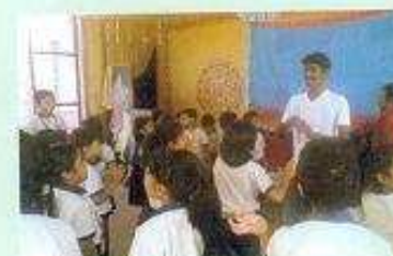
Grade II visit to Dhola-ri Dhari.