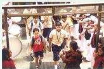
Grade VII - Night Stay