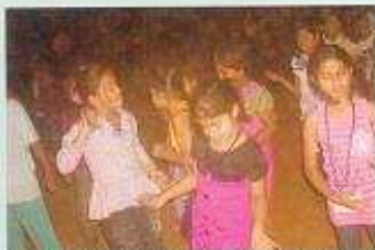
Grade III students enjoying their night stay.