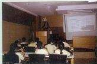
Resource person addressing the students of grade IV.