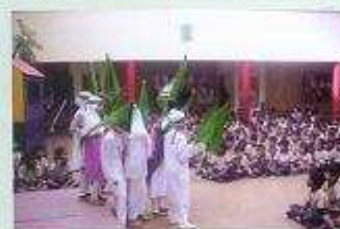
Milad-ul-nabi celebration in the assembly