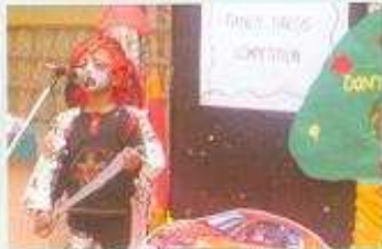
Fancy dress competition.