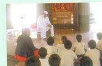
Grade I visit to Serva Dharma Sthala during their inquiry on culture.