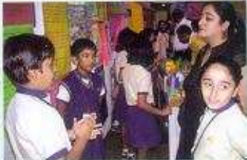
Grade V students explaining their research on societal decision making to parents.