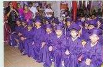
Graduation ceremony of grade V.