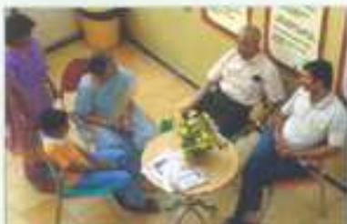
Welcome to hostel