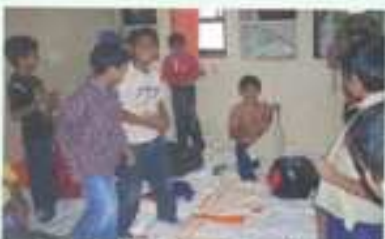
Grade III having fun during the night stay