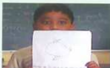
A Skilled boy with his presentation