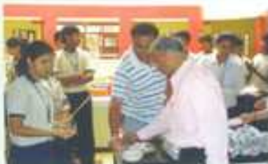
Welcome to Hostel