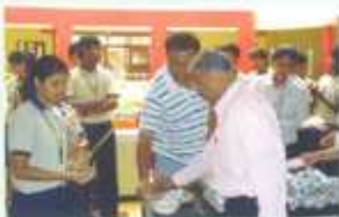
Welcome to Hostel