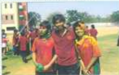
Celebrating Festival of Colours