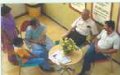
Welcome to hostel