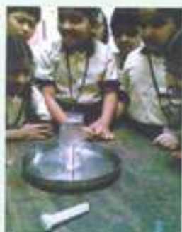
Experiment in progress