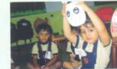
K-2 activity on the first day