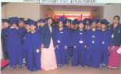
God bless ceremony grade V