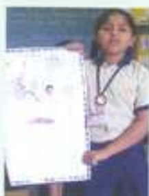
Grade III showing the life cycle of the ladybird through their presentation