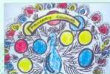
Sovari, Grade: V B