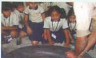
Grade III visit to DRS transport to support their inquiry about the properties of air