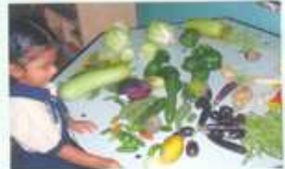
K-1 children learning about Fruits & vegetables