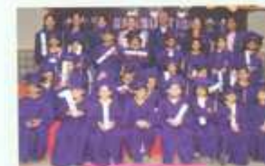
K-2 Graduation Ceremony