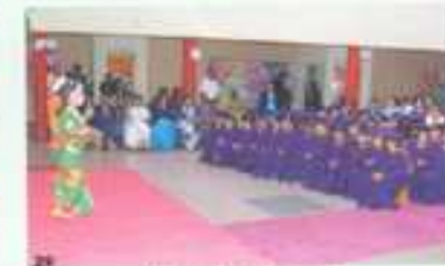
K Graduation ceremony