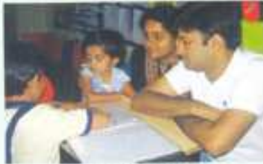
W-2.C on Feb 23rd