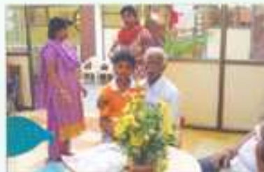
Let us dance- "All is well"