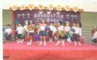
K-2 students performing on K-2's Graduation Day