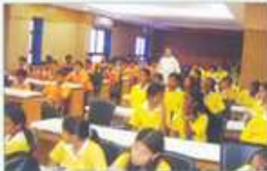
Chat with grand parents in AV room