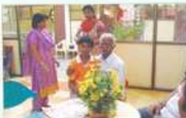
Let us dance- "All is well"