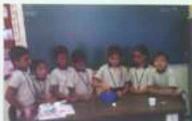
Grade III busy in their inquiry on properties of air