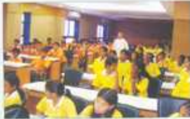
Chat with grand parents in AV room