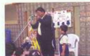
Magic show on K-2 Ice Breaking Day