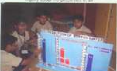
Grade IV integrating their end of inquiry with Mathematics