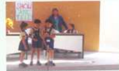
K-2 students Project on 'Show and Tell'