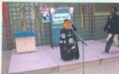
Fancy dress competition in primary