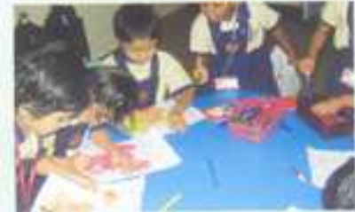
Activity in K Class